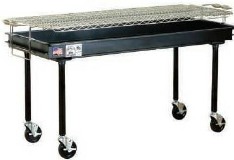
M-15B with Screw-in Legs and 5" Casters Shown with optional Wheel Locks

Folding legs are designed to setup quickly and are a real time saver for your staff. Our folding leg design also eliminates the nuisance and possible expense of misplacing a leg. These additional supports are why Big John's charcoal grills are extremely strong yet light enough to comfortably move on a daily basis.