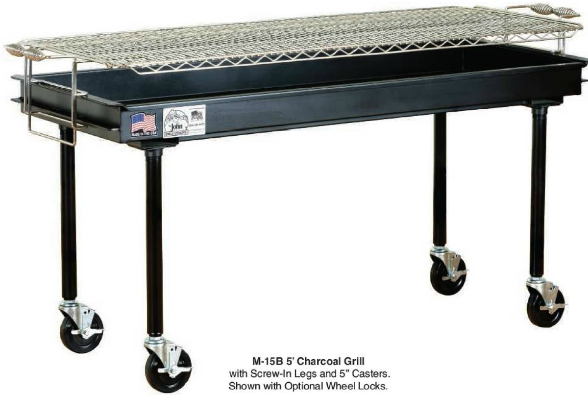
M-15B 5' Charcoal Grill with Screw-In Legs and 5" Casters. Shown with Optional Wheel Locks.