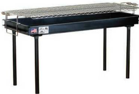
M-15AB with Screw-In Legs, No Casters

1 Folding Legs are welded to the firebox for quick setup and compact storage.