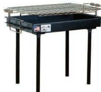
M-13AB with Screw-in Legs and No Casters