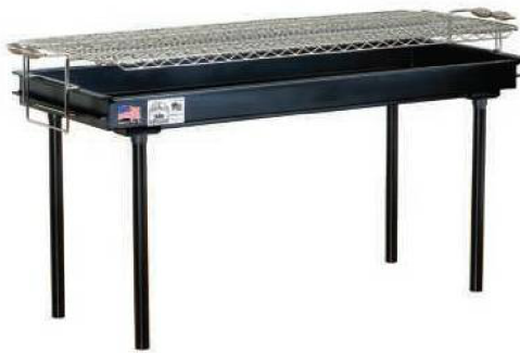
M-15AB 5' Charcoal Grill with Screw-In Legs and No Casters