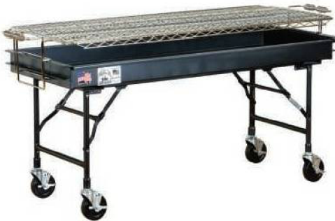
M-15FB 5' Charcoal Grill with Folding Legs and 5" Casters. Shown with Optional Wheel Locks.