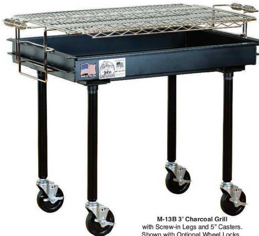
M-13B 3' Charcoal Grill with Screw-in Legs and 5" Casters. Shown with Optional Wheel Locks.