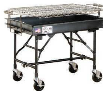
M-13FB Package with Folding Legs and 5" Casters Includes Leg Brace and Wheel Locks