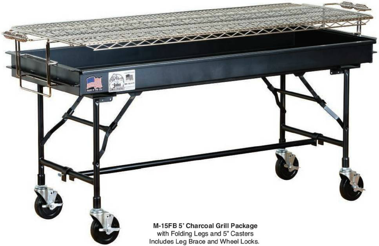
M-15FB 5' Charcoal Grill Package with Folding Legs and 5" Casters Includes Leg Brace and Wheel Locks.