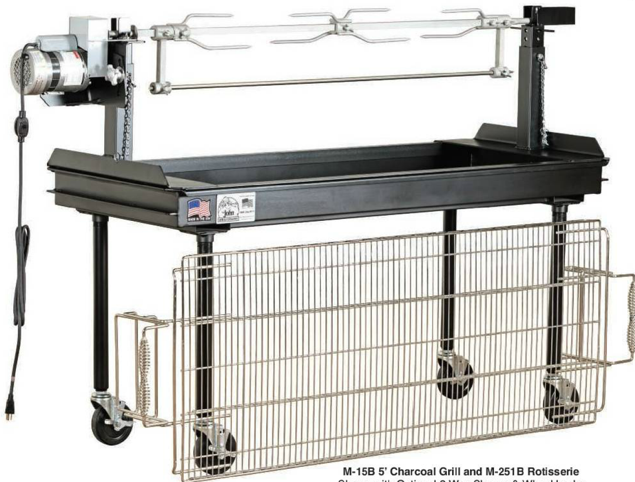
M-15B 5' Charcoal Grill and M-251B Rotisserie Shown with Optional 2-Way Skewer & Wheel Locks